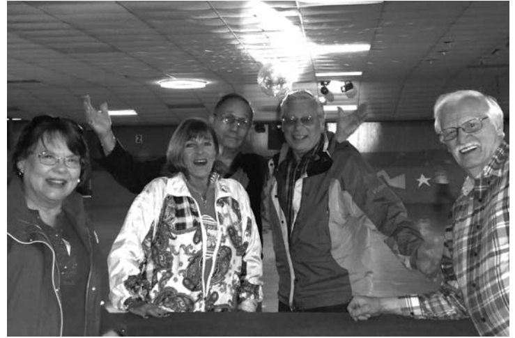
Everyone had a blast roller skating.