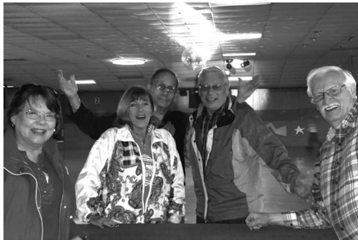
Everyone had a blast roller skating.