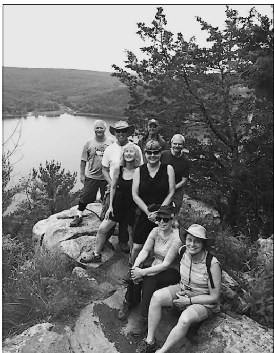
Devil's Lake provides a beautiful backdrop.