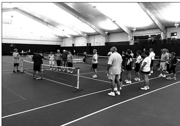
The group learns how to play pickleball.