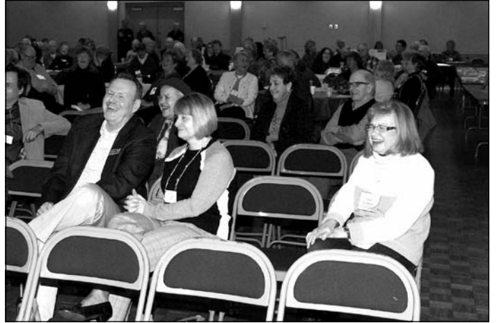
Ole and Lena make everyone laugh.