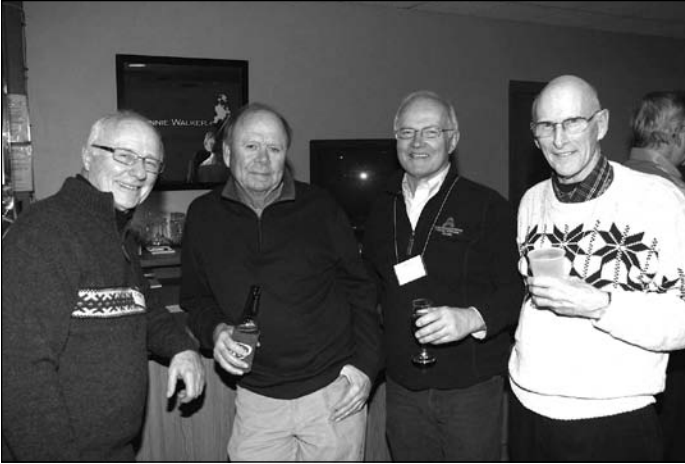
Gents sharing a drink at the January meeting.