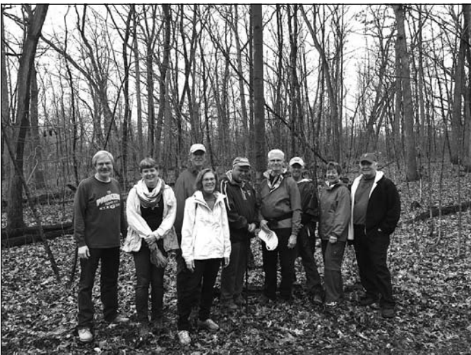
Muskego Park hikers enjoy the warm winter temps.