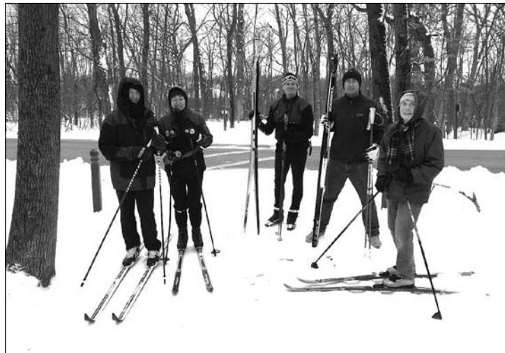
Cross country skiers at Minooka Park.