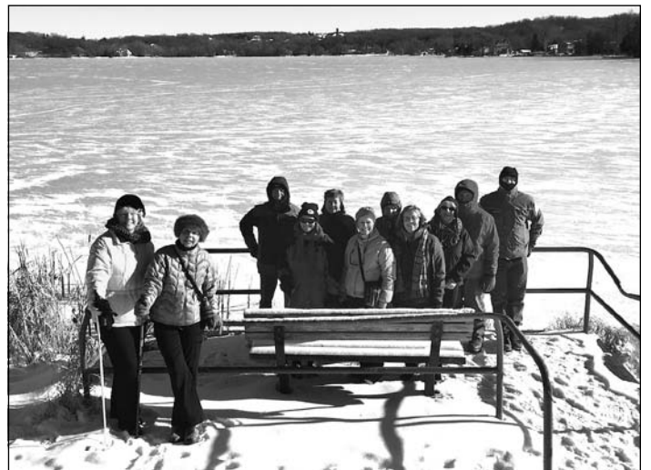
Hikers experience winter at Glacier Park only a few weeks later!