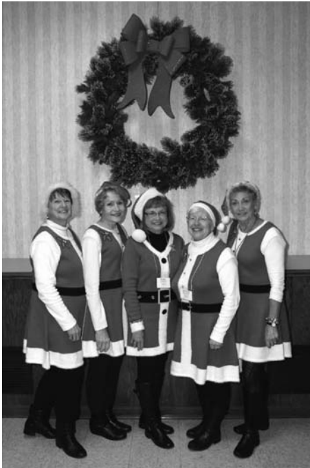
Vagabonds turned out for the December meeting and roundtable on Holistic Health.