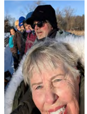
Hardy hikers on an 8-degree day at Scout Lake