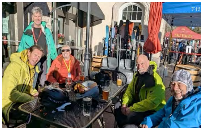
Vagabonds preparing for Big Sky in January and Snowmass in February.