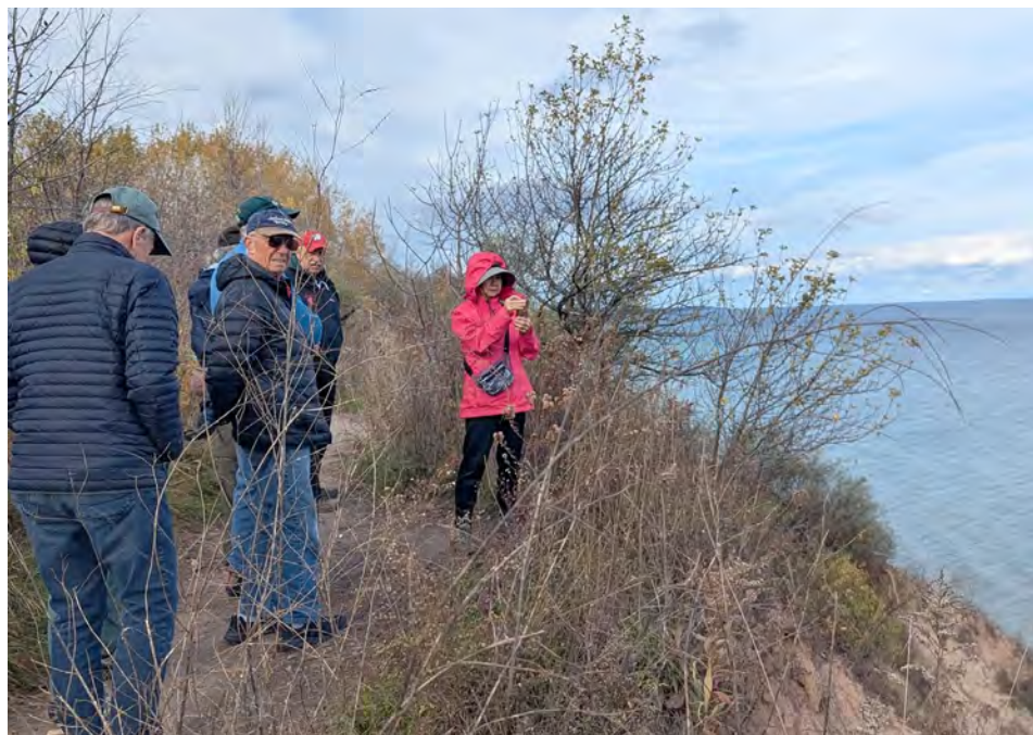
On the bluffs along Lake Michigan at Lion's Den Gorge. See the January hike schedule on Page 4.