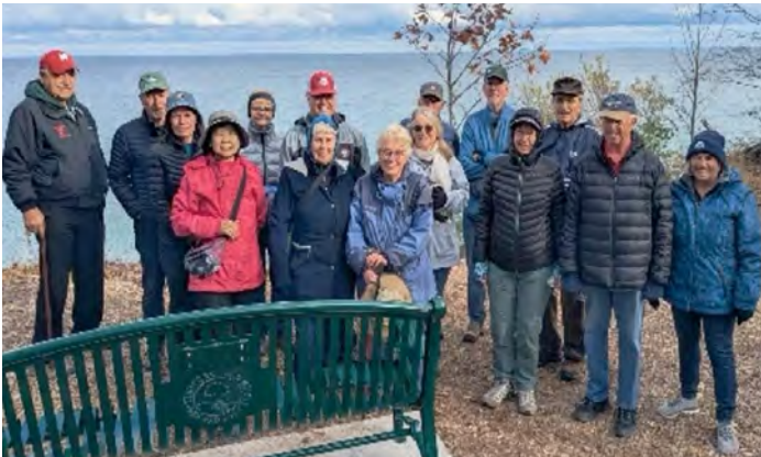
Lion's Den Gorge