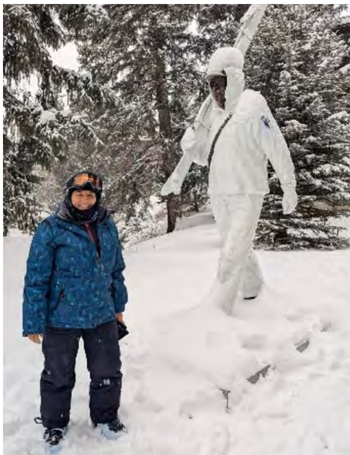
Visiting a Vail monument.

Of course, our local ski areas are close at hand for a special day on the slopes, and also for watching our ski racers.