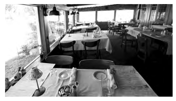
Last Journey of the Season (Wait-List Only) Sun., October 20 • Drinks 4:30-5:30 pm, Dinner 5:30 pm The Edgewater Supper Club 3522 County Rd K, Jefferson

The Edgewater Supper Club is a rustic farm to table restaurant located between Jefferson and Fort Atkinson along the beautiful Rock River. Its history dates back to the 1920's when it was a gambling hangout for the Canadian Mob.