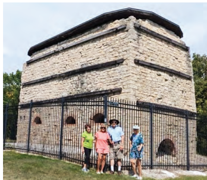
Lime Kiln Parkway, Menomonee Falls