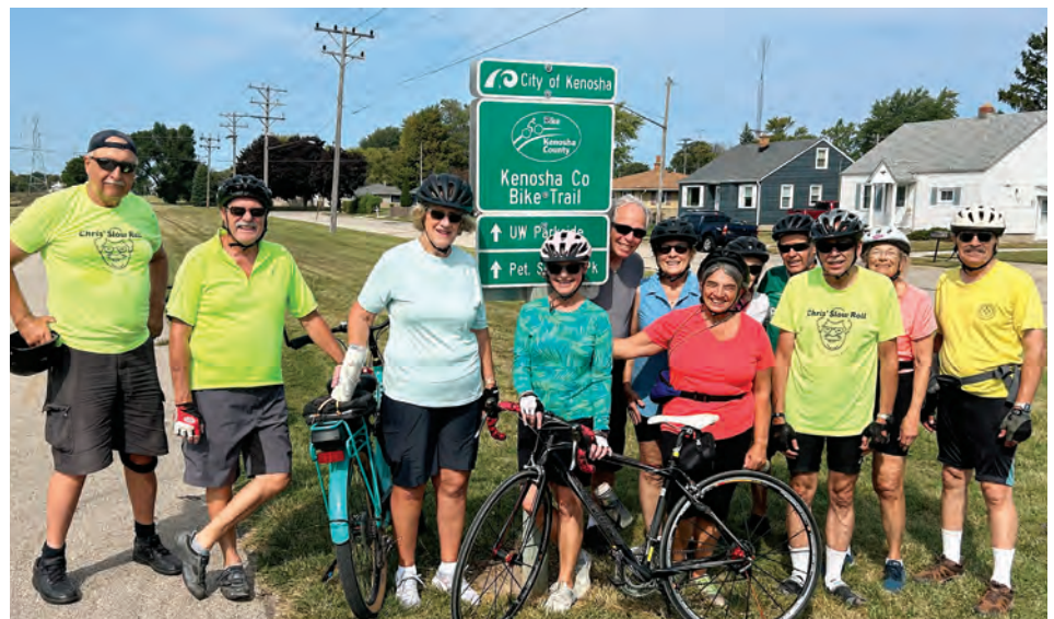
Cyclists set out from Petrifying Springs Park and followed a route through Kenosha County. The club's final ride of the year will start at 1:45 p.m. Sept. 29 at Sunset Park in Waukesha.

The following week, group biking is replaced with group hiking. See Page 3.