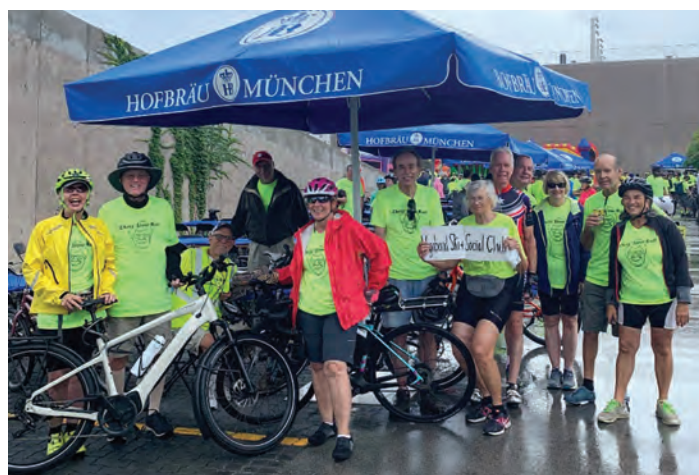
Eleven Vagabonds participated in the 7th annual Chris Kegel Memorial Ride.