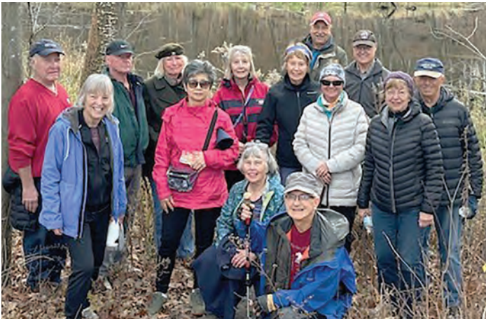
Pike Lake State Park.

Metropolitan Milwaukee Ski Council Senior Racing has 14 races scheduled over seven dates this winter. About 40 skiers compete in one of four non-gender classes based on skill level. Two different courses are run for each race, and the