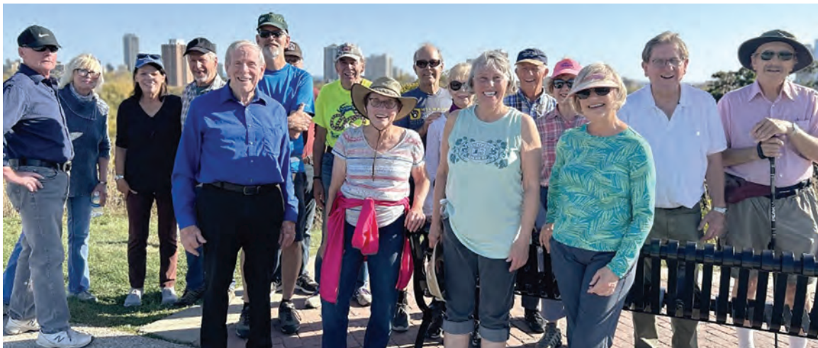
Hikers on the Milwaukee lakefront.