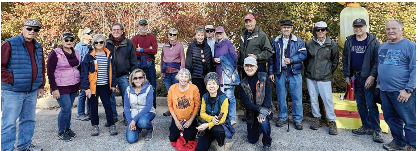
A big turnout on a beautiful day at Whitnall Park.