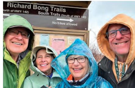
Rain didn't deter these Vagabond hikers from enjoying Bong Recreation Area.

Dec. 29 – Lapham Peak State Park: Take I-94 west to Hwy. C, then turn left to park entrance. Meet at the middle parking