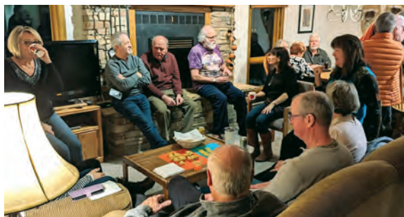
Wine and cheese (and Aperol Spritz) in the trip leaders' Crested Butte condo.