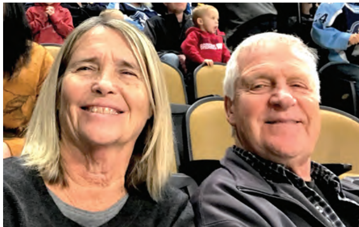
At the Vagabonds' ice-hockey outing to UW-Panther Arena in downtown Milwaukee to watch the Admirals play.