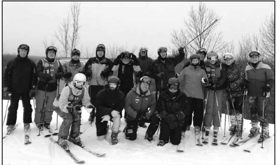
2017-2018 Vagabond Ski Racing Team at Holy Hill