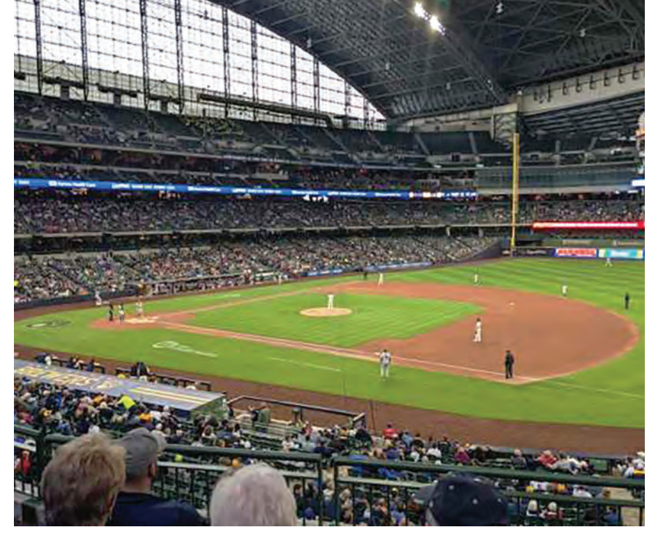
10 • May 2023 • VagabondSkiClub.com