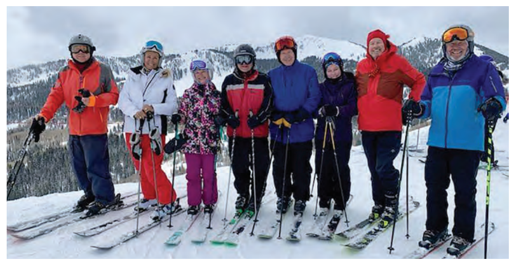
Park City skiers get set for another run.

Watch your email, the club website and this newsletter for more details on next season.