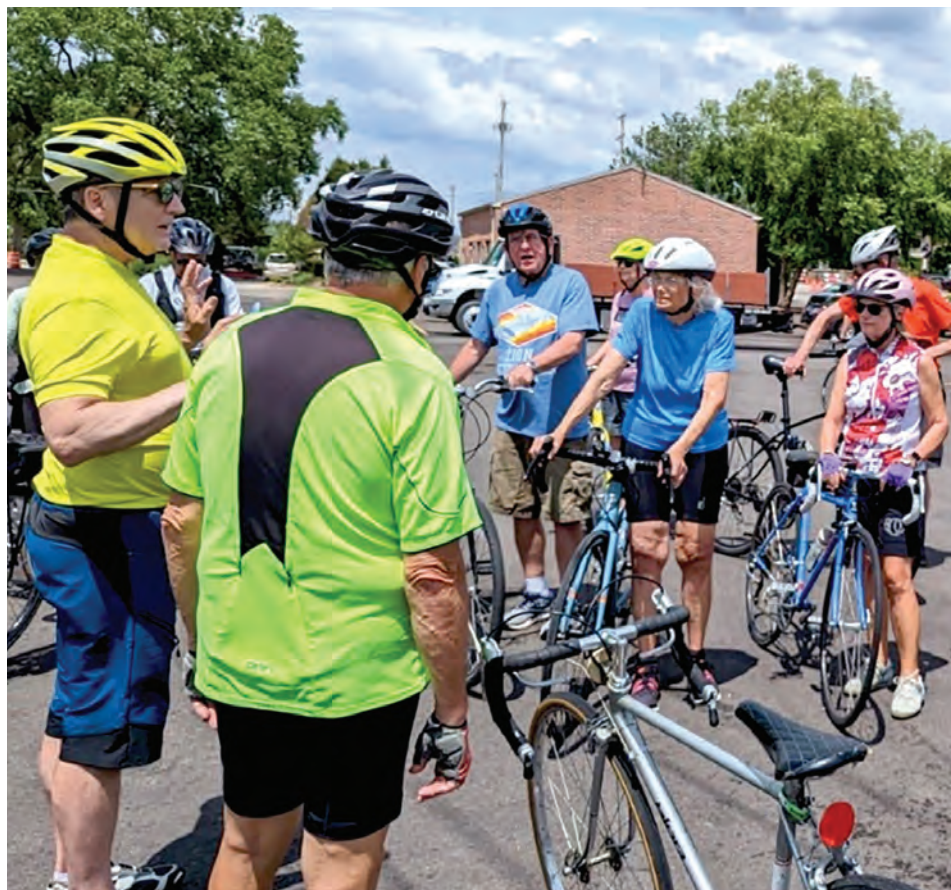
Onto the Interurban Trail. ... For this month's bike ride routes, see Page 4.