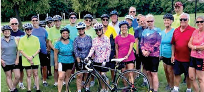
Along the Hank Aaron Trail.

Aug. 27, 9:30 a.m., Chris Kegel Slow Roll – note the special start time – Be there by 9 a.m. The ride starts promptly at 10. The Vagabonds will be riding with others in a biking fund-raiser. We will meet at the Milwaukee County War Memorial Center parking lot, 750 N. Lincoln Memorial Drive. Parking will be on Lincoln Memorial Drive and at McKinley Park, Veterans Park and the Art Museum.