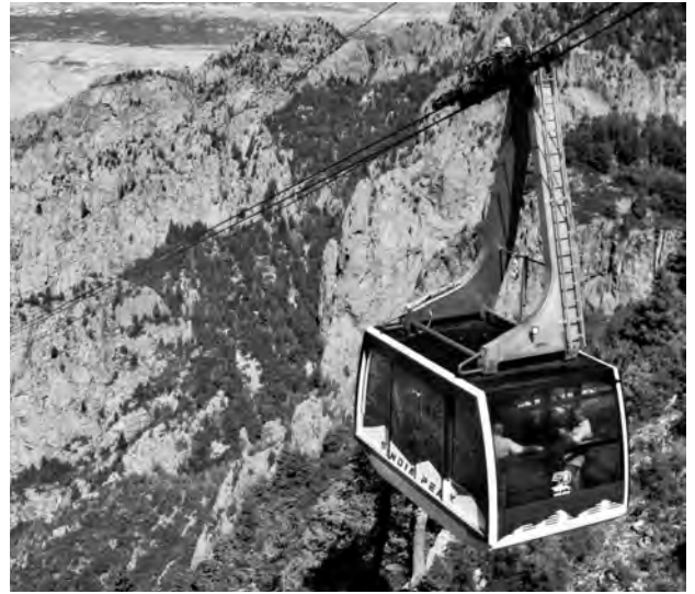
Sandia Tram Ride, October 6