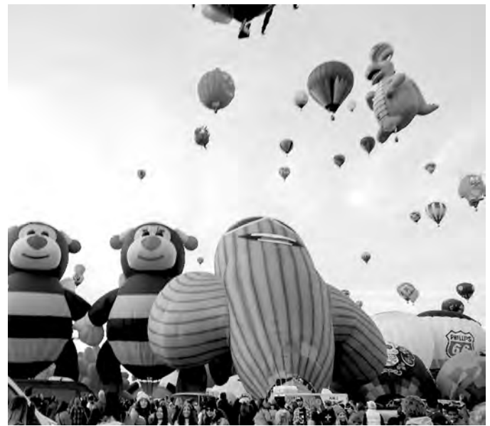
Albuquerque Balloon Fest, October 7