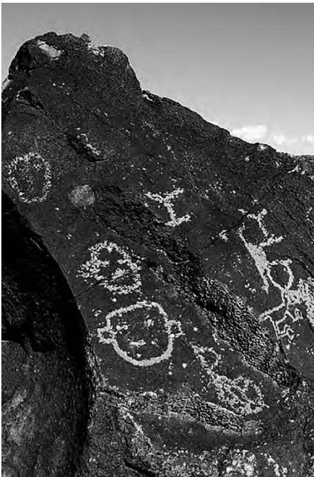
Petroglyphs at Boca Negro Canyon, October 5