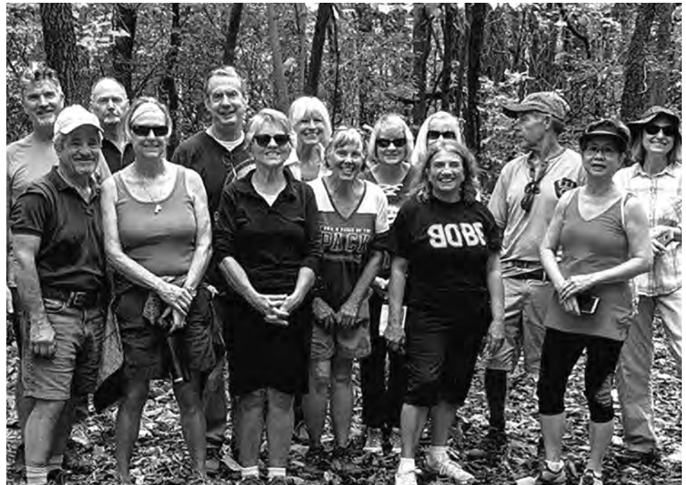
Sunday Hike at Minooka Park, October 3