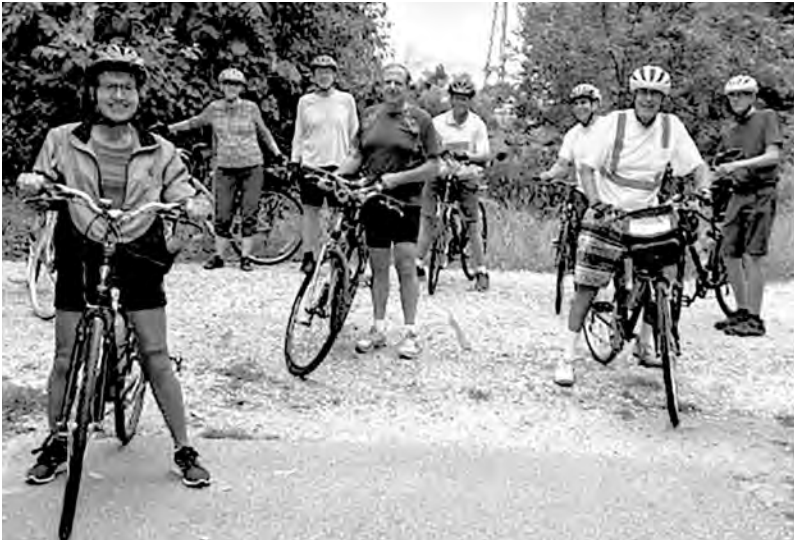
Bugline Trail Bike Ride, September 12