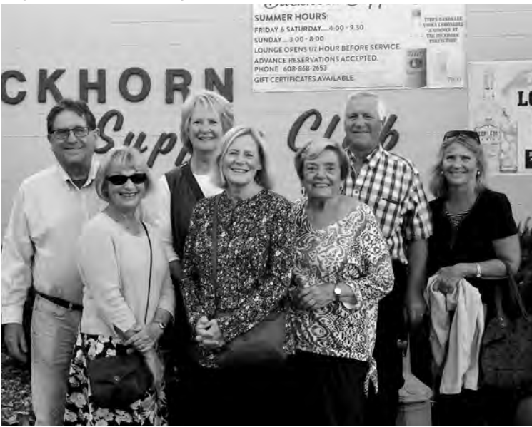
Buckhorn Supper Club, September 28