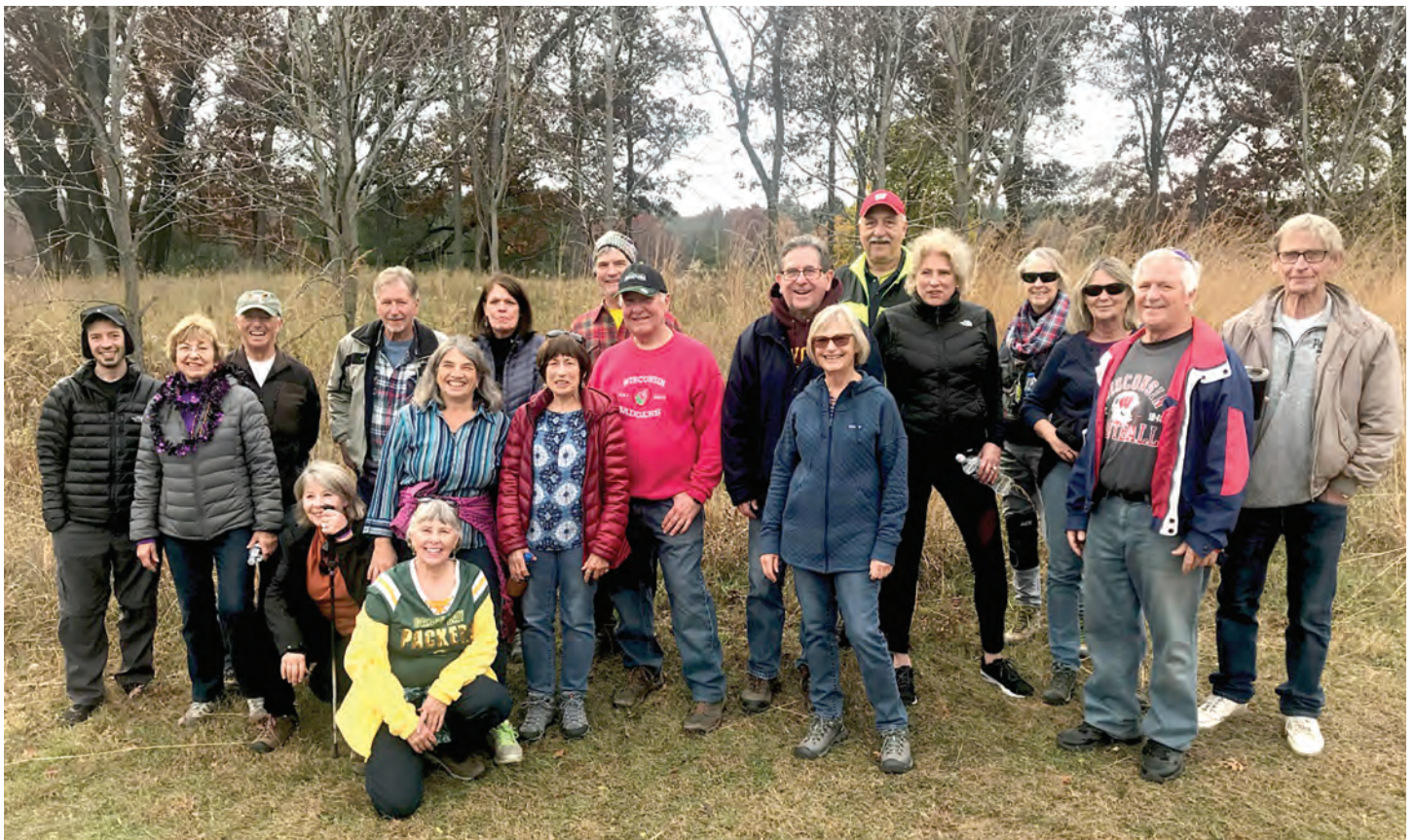
Hiking at Lapham Peak.

Come Spring, we will probably select a different day of the week for our planned Vagabond midweek walks, and also have an optional lunch stop afterward at the discretion of the leader.