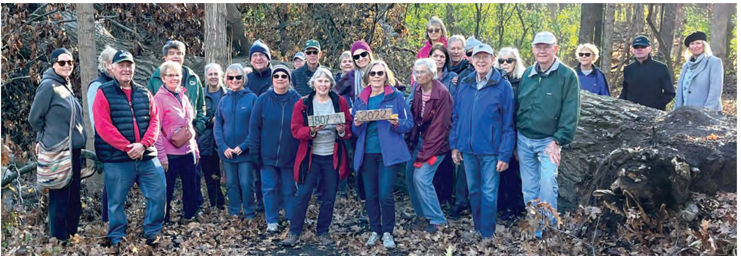
Whitnall Park hikers encounter an ancient tree.