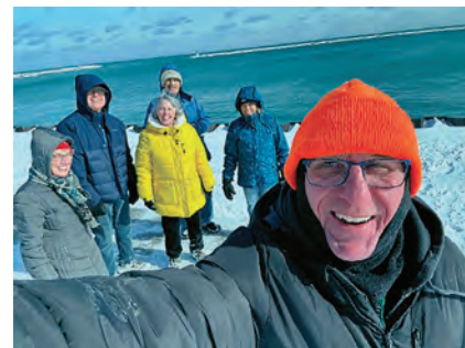
On the snow shore.