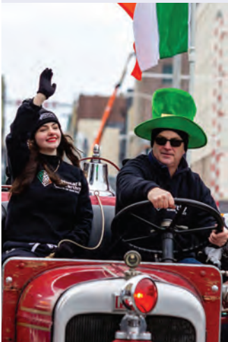
Monday, March 17