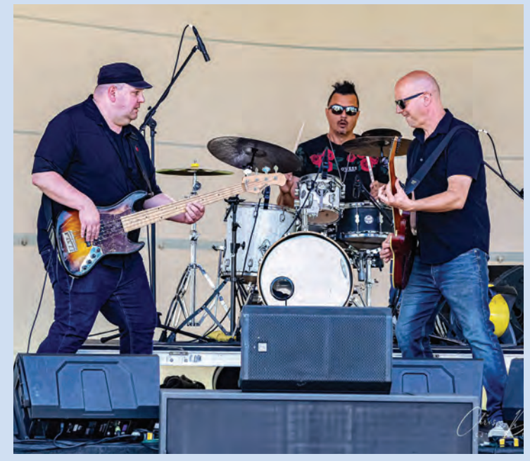
Dirty Boogie has the best that moves your feet. On the dance floor, you will want more.