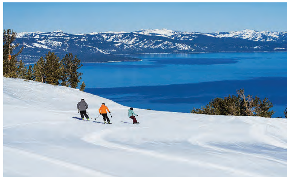
Overlooking Lake Tahoe from Heavenly slopes. See Page 3.