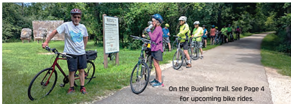
On the Bugline Trail. See Page 4 for upcoming bike rides.

Email JanBreitbach@gmail.com or call (414) 732-9749.